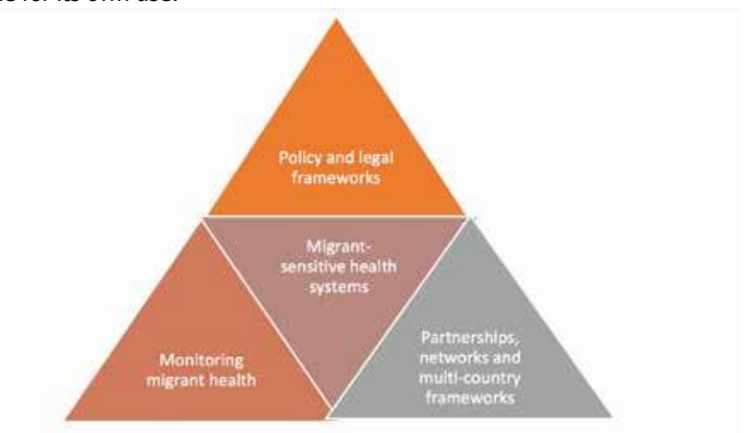
Figure 4. WHO Framework to address challenges of Migration and Tuberculosis

into the issues surrounding migrant leprosy patients, and their households; and help design strategies to meet existing gaps and challenges The World Health Organization (WHO) has proposed a framework in the leprosy programme management.